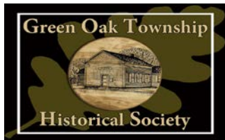
Illustration by George DeAngelis