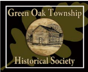
Illustration by George DeAngelis