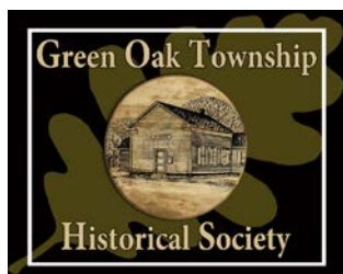
Illustration by George DeAngelis