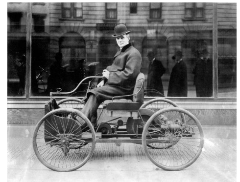
Henry Ford in his first Quadricycle