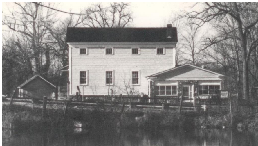
Greenock Mill circa 1983